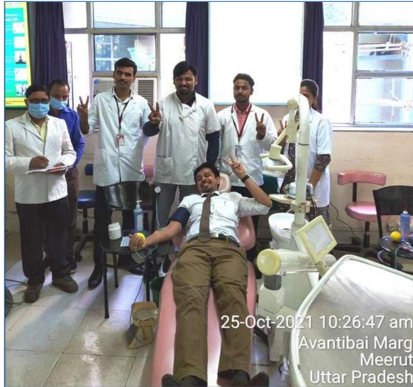
25-Oct-2021 10:26:47 am Avantibai Marg Meerut Uttar Pradesh