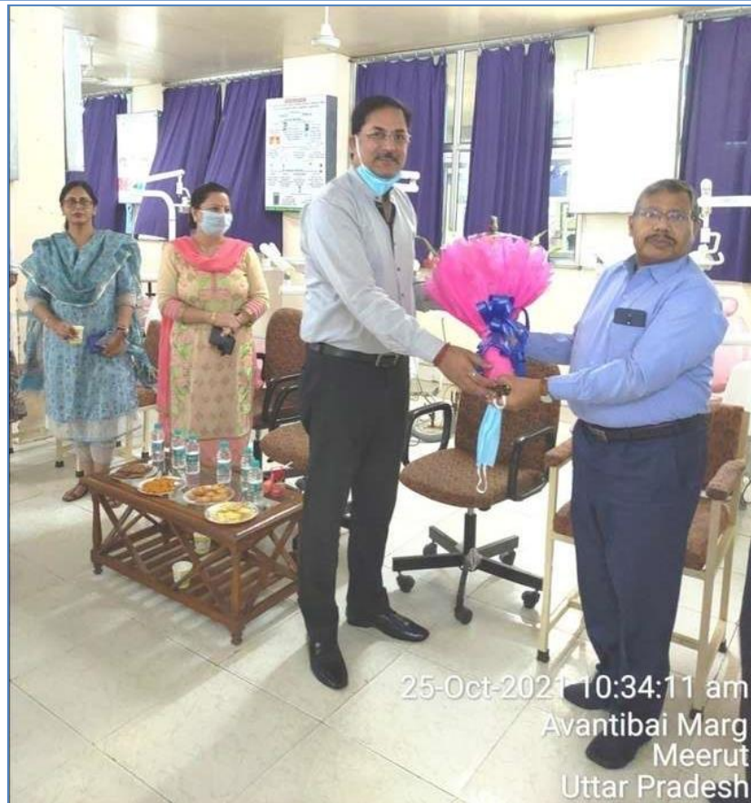
25-Oct-2021 10:34:11 am Avantibai Marg Meerut Uttar Pradesh