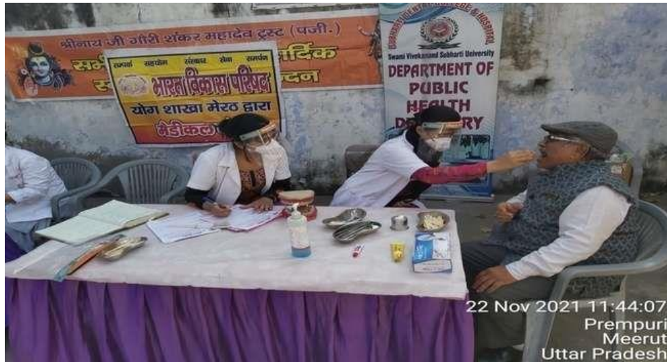
22 Nov 2021 11:44:07 Prempuri Meerut Uttar Pradesh