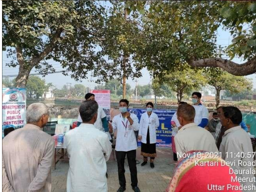
Nov 10, 2021 11:40:57 Kartari Devi Road Daurala Meerut Uttar Pradesh