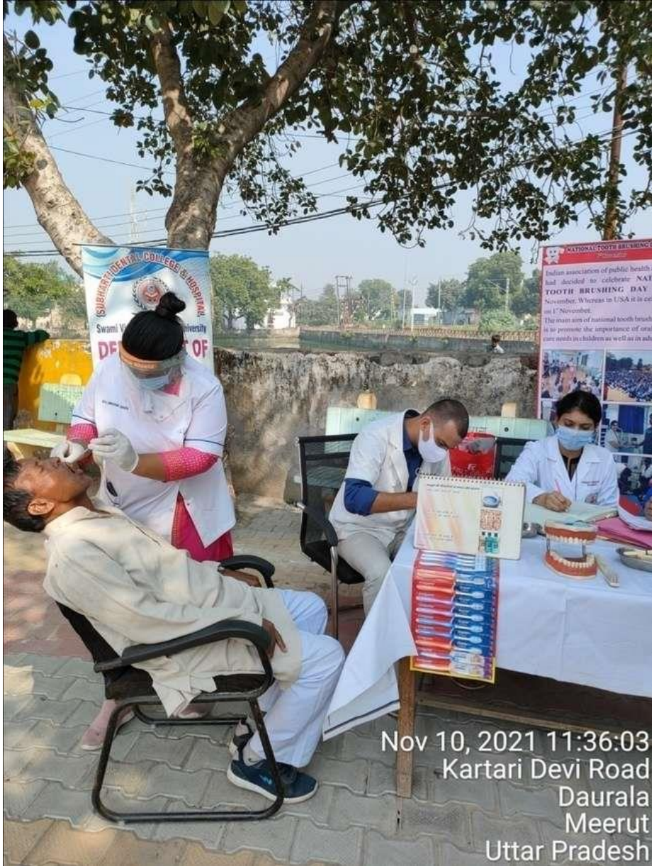
Nov 10, 2021 11:36:03 Kartari Devi Road Daurala Meerut Uttar Pradesh