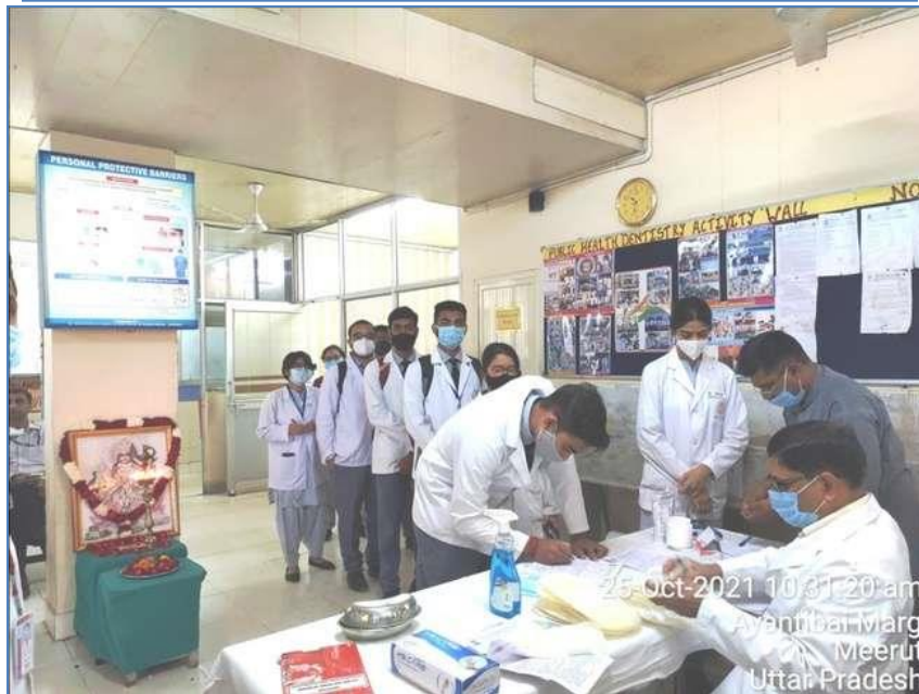
25-Oct-2021 10:31:20 am Avantibai Marg Meerut Uttar Pradesh