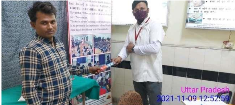
Uttar Pradesh 2021-11-09 12:52:59