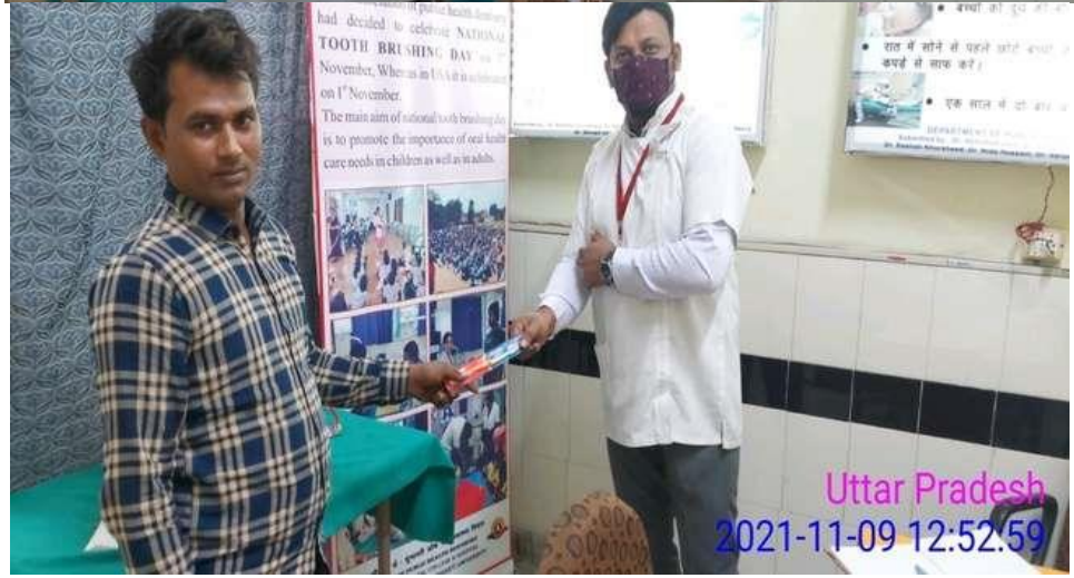
Uttar Pradesh 2021-11-09 12:52:59