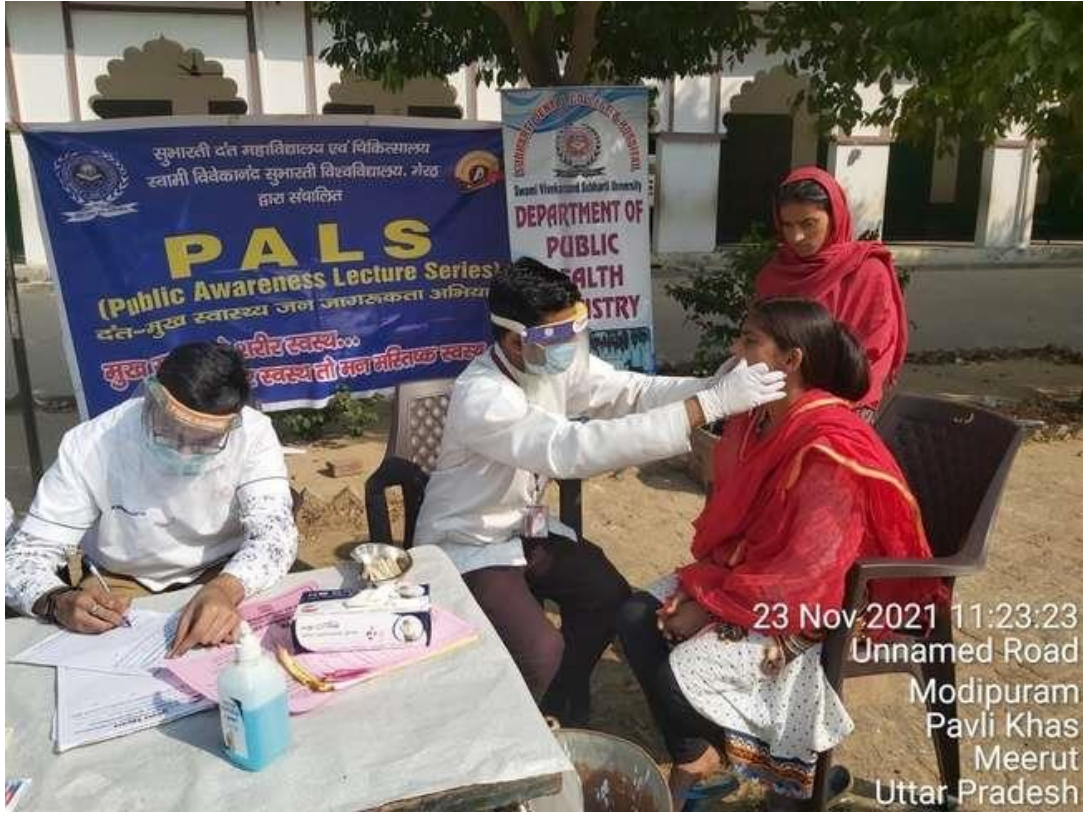
23 Nov:2021 11:23:23 Unnamed Road Modipuram Pavli Khas Meerut Uttar Pradesh