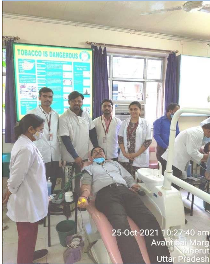
25-Oct-2021 10:27:40 am Avantibai Marg Meerut Uttar Pradesh