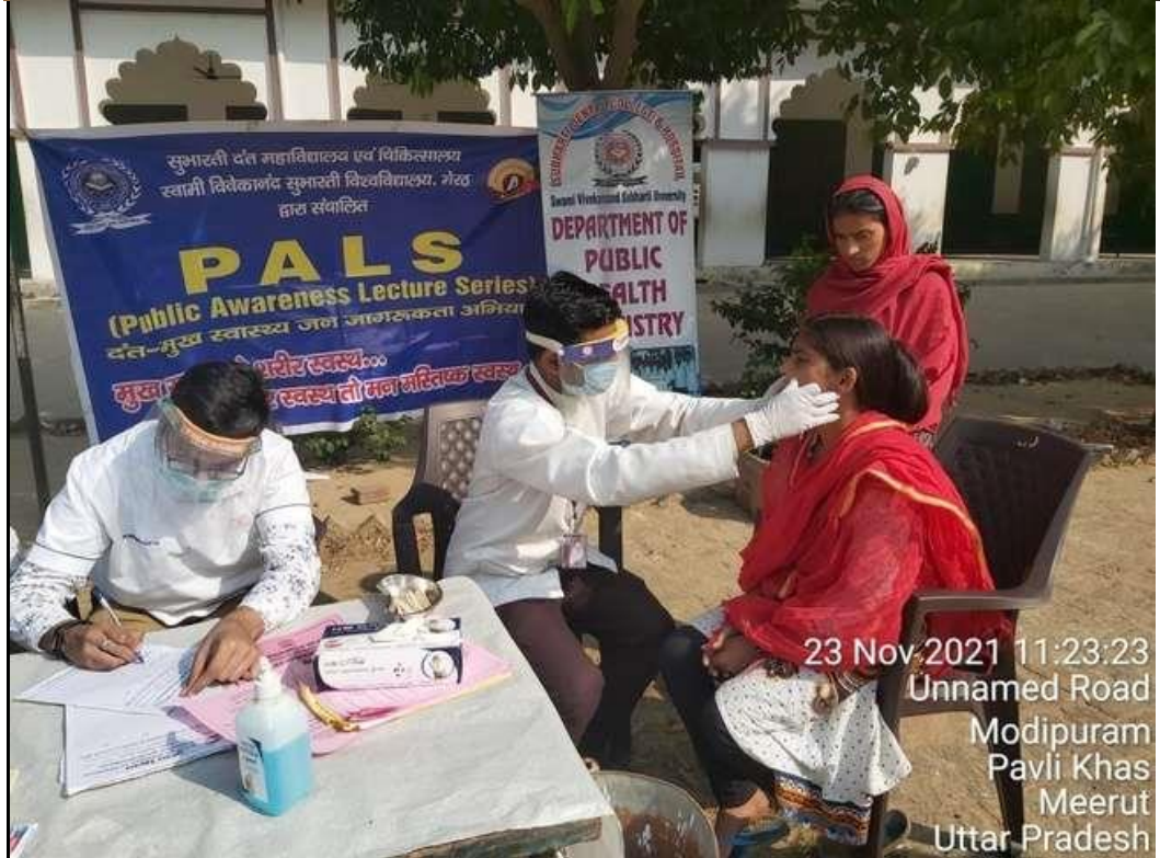
23 Nov 2021 11:23:23 Unnamed Road Modipuram Pavli Khas Meerut Uttar Pradesh