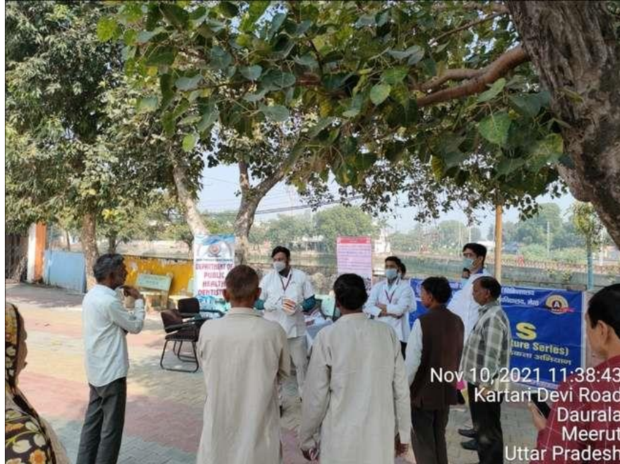
Nov 10, 2021 11:38:43 Kartari Devi Road Daurala Meerut Uttar Pradesh