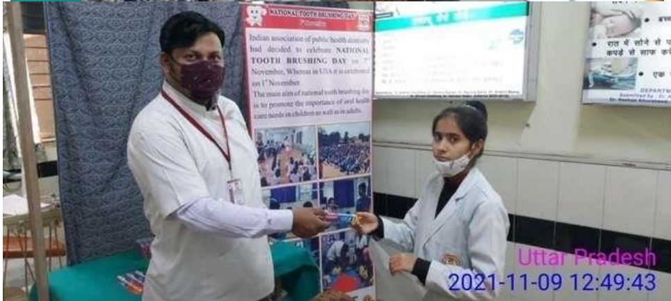
Uttar Pradesh 2021-11-09 12:49:43