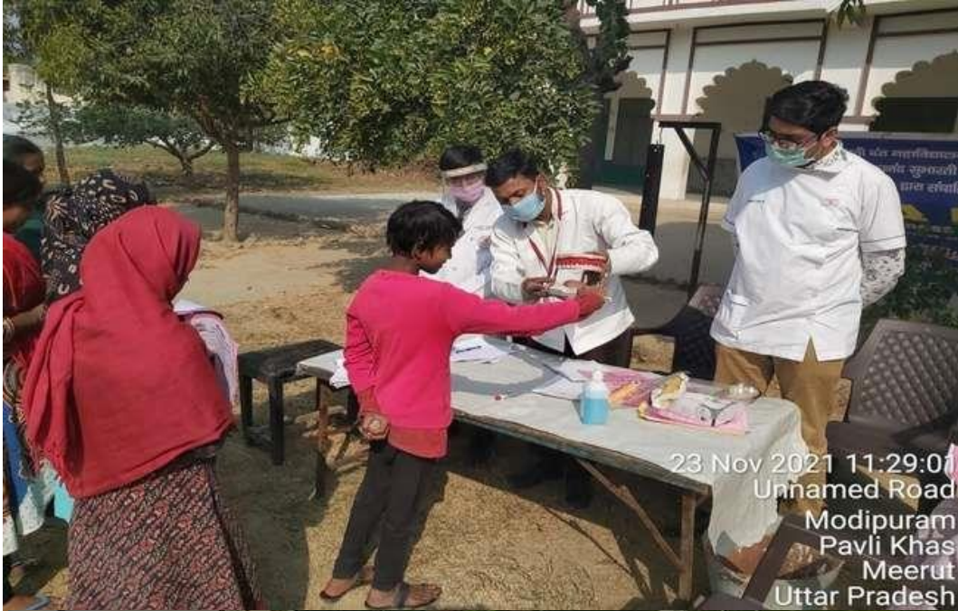
23 Nov 2021 11:29:01 Unnamed Road Modipuram Pavli Khas Meerut Uttar Pradesh