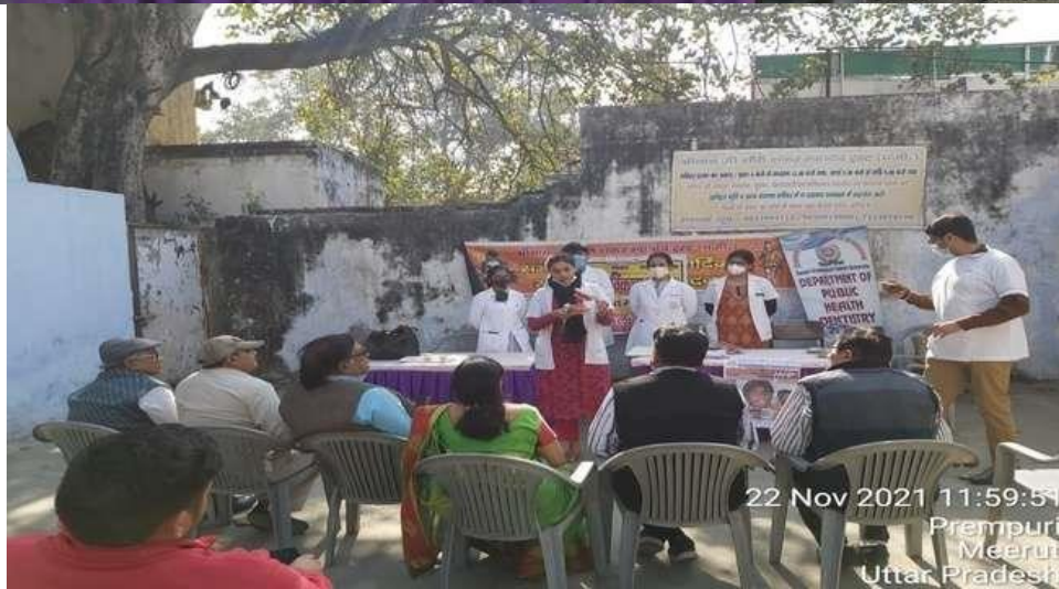
22 Nov 2021 11:59:51 Prempuri Meerut Uttar Pradesh